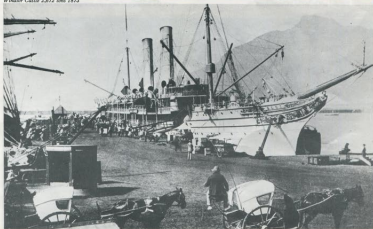
Scot 6544 tons 1891